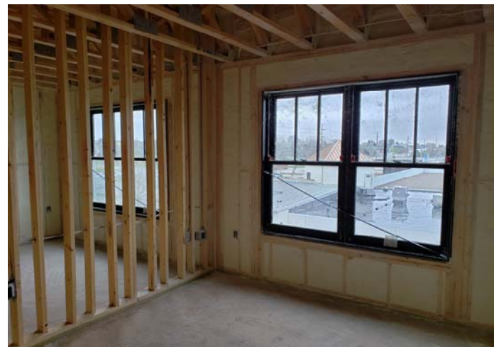
RIGHT: Edwinton Place framing and insulation, Bismarck, 2019