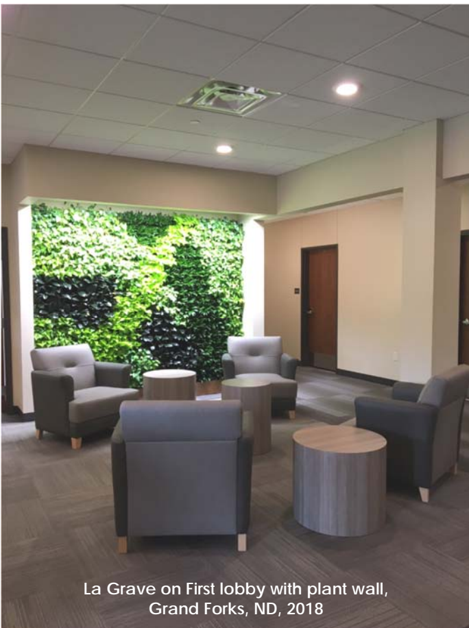
La Grave on First lobby with plant wall, Grand Forks, ND, 2018

BSI has made the necessary adjustments and found a way to carry on. While initially focused on Fargo, the organization responded to flooding in Minot in 2011 by building affordable replacement housing to help address the serious housing needs that resulted. When oil boomed in western North Dakota, BSI stepped up to help increase the affordable housing options for people in the oil patch including seniors, essential service workers, and law enforcement personnel. An increase in production has led to our staff growing from one in 1999 to eleven in 2019. In 2015, BSI outgrew the space it leased from the Fargo Housing & Redevelopment Authority and the staff relocated to new office space. So many changes, but one thing stays constant, BSI's commitment to improving lives and creating communities by developing and sustaining housing for those most in need.