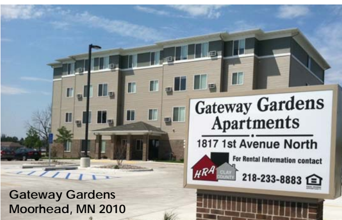
Gateway Gardens Moorhead, MN 2010