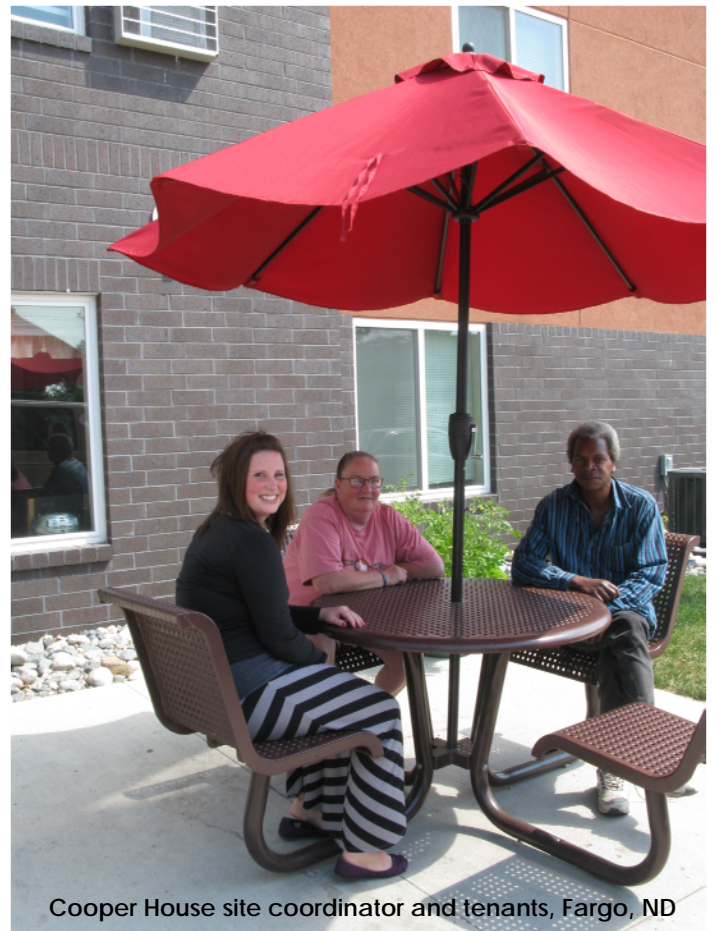
Cooper House site coordinator and tenants, Fargo, ND