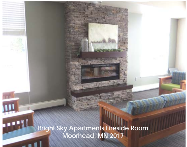
Bright Sky Apartments Fireside Room Moorhead, MN 2017

In an effort to continue to deliver on its mission, BSI has evolved in a number of ways. Energy efficiency and Green Building are now a focus in every new development. The benefits include lower operational costs, as well as greater comfort, convenience, and health for tenants. The scale of developments has increased from 8-12 units in the early days to a current average of 40 units. The larger scale results in efficiencies on both the construction and the operational side. As the developments have gotten larger the financing has gotten more complex. Beyond Shelter has utilized 20 different funding programs in the past 20 years. After the 2008 mortgage crisis investment in affordable housing plummeted. The organization had to tap into new funding sources and was able to develop its first permanent supportive housing at a time when not very many deals were getting done. With each change in the economy or in public policy that affects affordable housing,