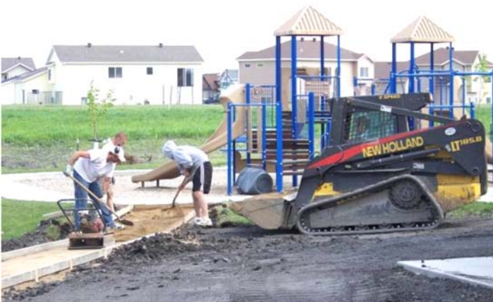
ABOVE: Bluestem playground installation, Fargo, ND, 2006